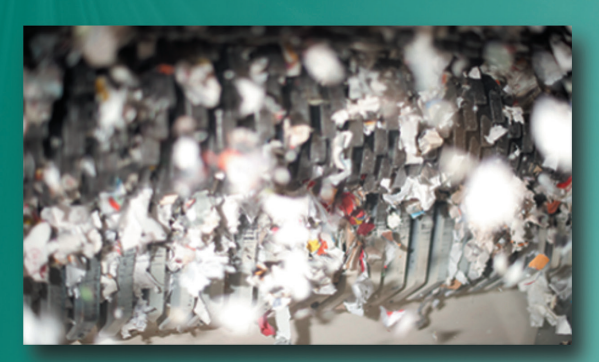
Destruction de Données